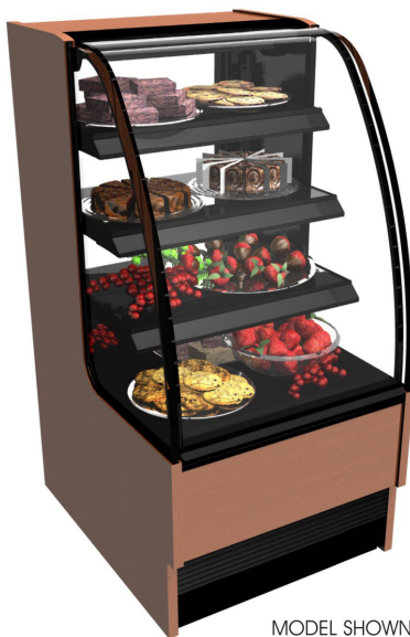
MODEL SHOWN: HMG2653R