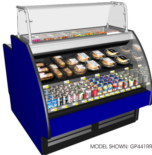
MODEL SHOWN: GP441RR

NOTE: INTERIOR PANS NOT PROVIDED W/CASE GP441RR HOLDS (2) FULL SIZE 4"D PANS GP641RR = (3) PANS - GP841RR = (4) PANS