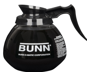
DECANTER, GLASS-BLK 12C 3/CS