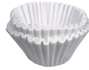
FILTERS,REGULAR1M 500/2 50/CL