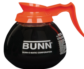
DECANTER, GLASS-ORN 12C 3/CS