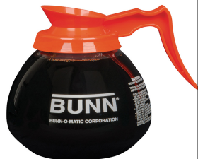
DECANTER, GLASS-ORN 12C 24/CS