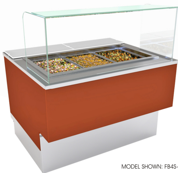
MODEL SHOWN: FB4S-3R