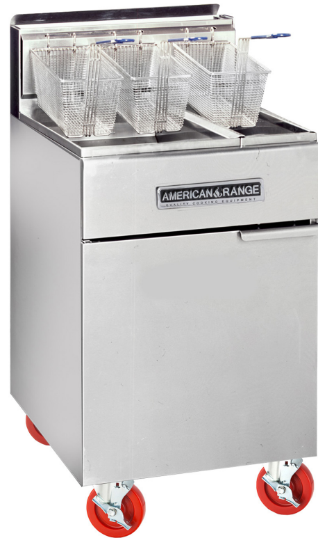
AF-50/25 Shown with optional casters

You get a faster and better fryer from American Range. With the latest technology incorporated into its design, and tons of features and benefits to suit the everyday demanding needs especially during extreme operating periods. Bringing added value and assured performance, by offering the highest BTU rating for superior recovery. The ample "cool zone" prevents food particles from carbonization while extending oil life. Our unique vessel tank design features a deeper oil level, for larger food products, and a sloping vessel bottom for quick and complete draining of oil and debris.