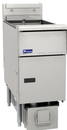
SFSE14 (R,X) w/ standard SSTC