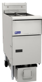
SFSE14T (R,X) w/ optional rear casters