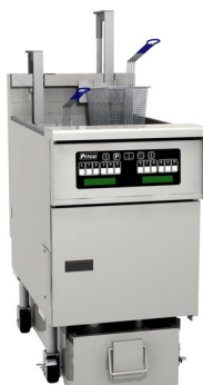
SFSE18 (R) w/ optional I12 computer & Basket Lifts, front / rear casters