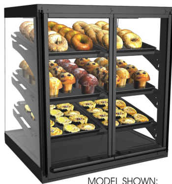
MODEL SHOWN: CGS2830 SELF-SERVICE