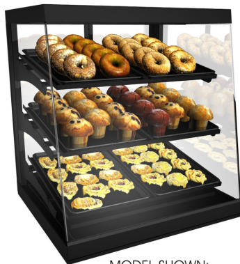
MODEL SHOWN: CGS2830 SERVICE

Lengths include end panels 28-1/8"L x 25"D x 30-5/8"H 38-1/8"L x 25"D x 30-5/8"H